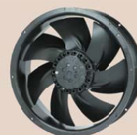
IP68/69K Fan / Motor