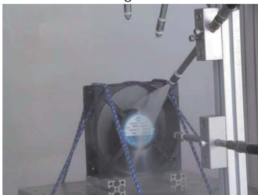
2-3 IPX9K Testing 30°