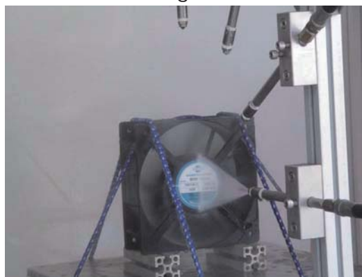
2-2 IPX9K Testing 0°