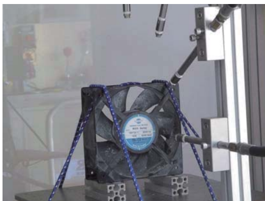
2-1 IPX9K Before Test