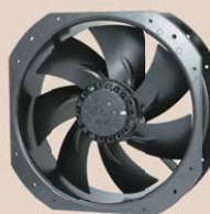
3-Phase Fan / Motor