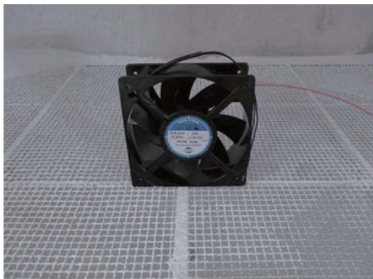
1-1 IP6X Before Test