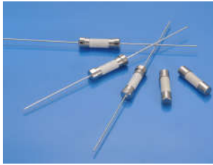
Dimensions (unit: mm)