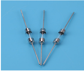
Dimensions (units: mm)