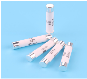
Dimensions (unit: mm)