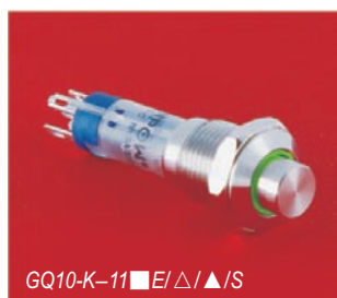
GQ10-K-11 E/ /△/△/S

Contact Structure 1NO1NC Operation type Z: Latching / No letter means momentary Illuminated Type Ring illuminated LED Color R G Y B W Voltage 6V/12V/24V Housing Material Stainless steel Protection class IP40 Tail configuration Wiring patch(1.8x0.4mm)