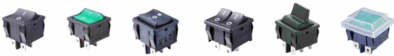
MR-4-210-C5N-BB MR-4-210-C5L-BG MR-4-230-C6N-BB MR-4-210-D5N-BB MR-4-220-HON-BB MR-4-210-C5L-BG+防水帽